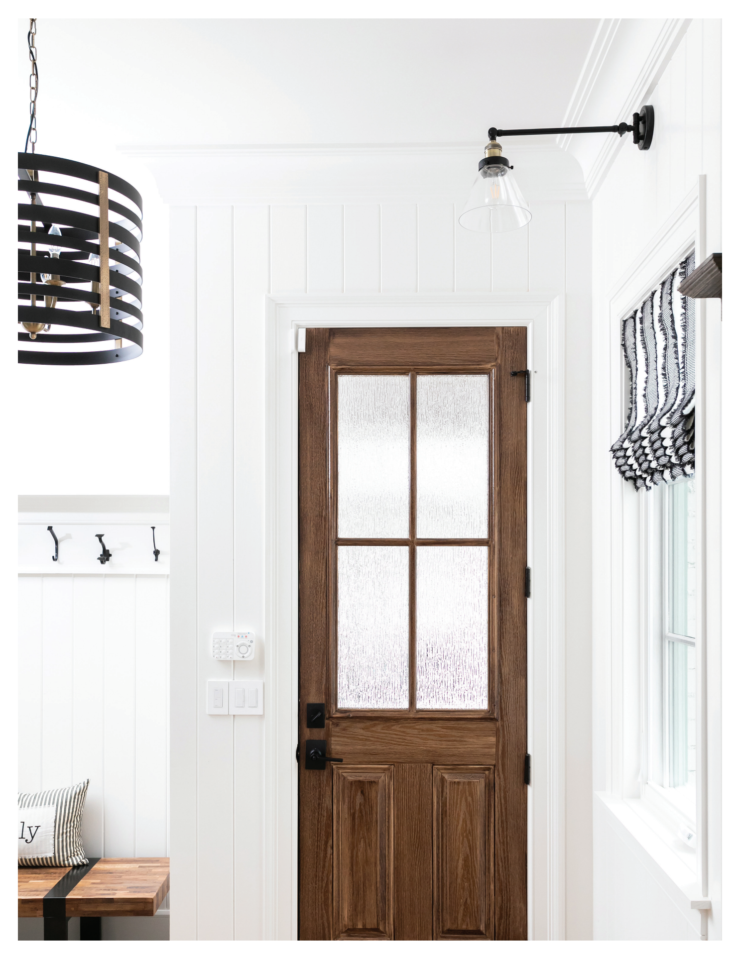
AUGUST/SEPTEMBER 2020 | HOME DESIGN & DECOR TRIANGLE 59